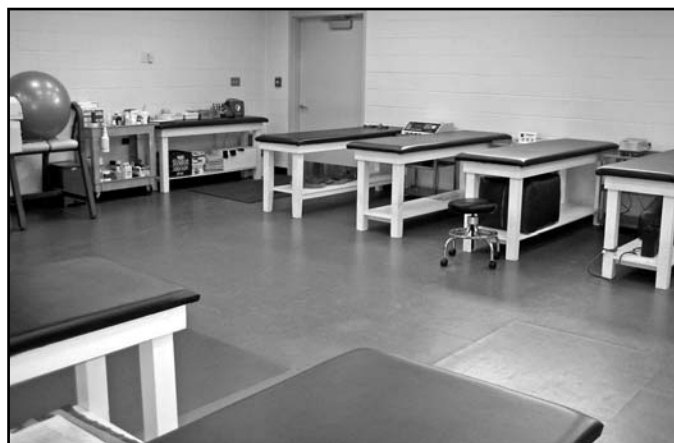
The Clarkson-McKenna Training Room services the Keydet football team and is one of three such facilities on post.

The Sports Medicine Department is also grateful to be involved with many physicians in the Lexington area which play an integral part in the health care of cadet athletes. These physicians have always been very generous with their time and efforts on behalf of VMI athletes.